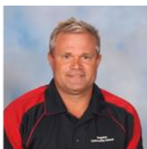
Craig Watson Technologies - Design and Technology Studies