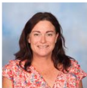
Rebecca Willis Technologies - Food & Fibre Production