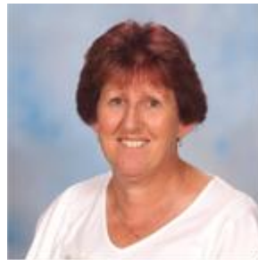
Sheree Brown Community Library