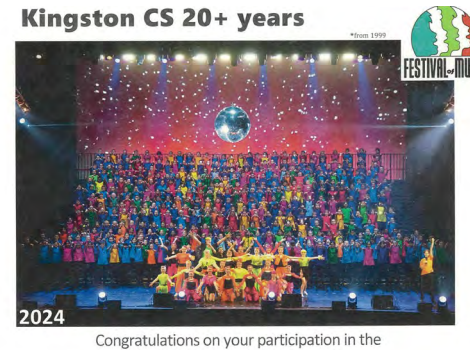
Congratulations on your participation in the Primary Schools Music Festival

for 25 years. The Festival of Music is an iconic event in South Australia, providing students across all of South Australia the opportunity to sing and learn music and then perform in a theatre.